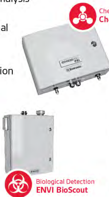
Biological Detection ENVI BioScout