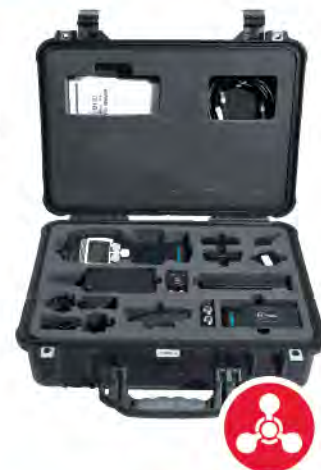
Chemical Detection ChemPro100i w/CBRN kit