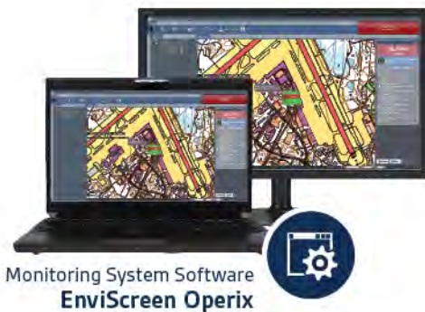
Monitoring System Software EnviScreen Operix

Scalable EnviScreen CBRN Monitoring Systems integrate easily variety of instrumentation from CBRN detectors to camera surveillance. As a key element, Envionics shares situational awareness and guidance for incident management through its proprietary EnviScreen Operix system software. It offers not only real-time status and measurement data for multiple locations, but tools for essential operator training and simulation, reporting and integration to 3rd party systems. As a trusted partner, Envionics support its customers through the whole life-span of its system solutions.