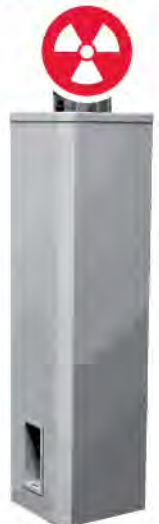
Radio Nuclear Detection RapidPort-N